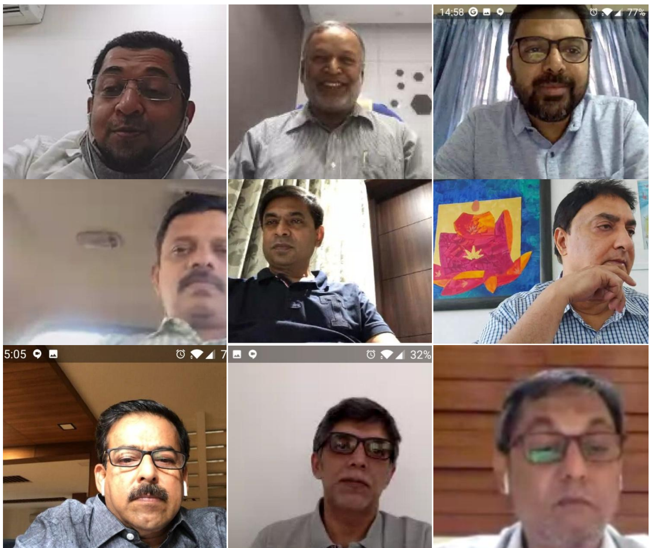
PHOTO-GALLERY of Members of IFLMEA who were engaged in the discussions